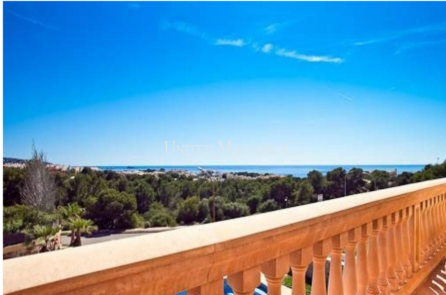
MEDITERRANEAN SEA VIEW VILLA, SOUTH-FACING, CLOSE TO PORT ADRIANO