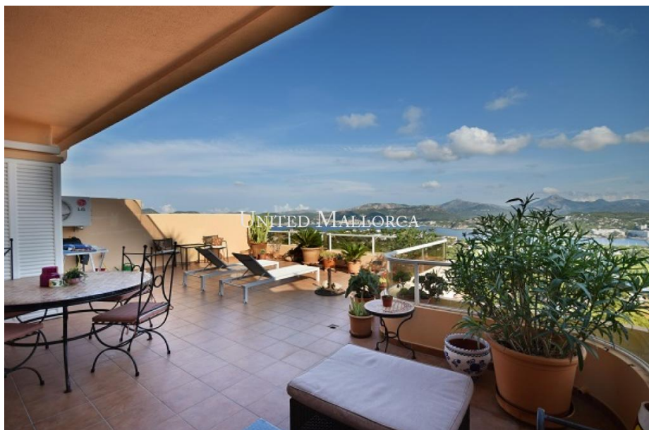
APARTMENT WITH PANORAMIC SEA VIEWS IN NOVA SANTA PONSA