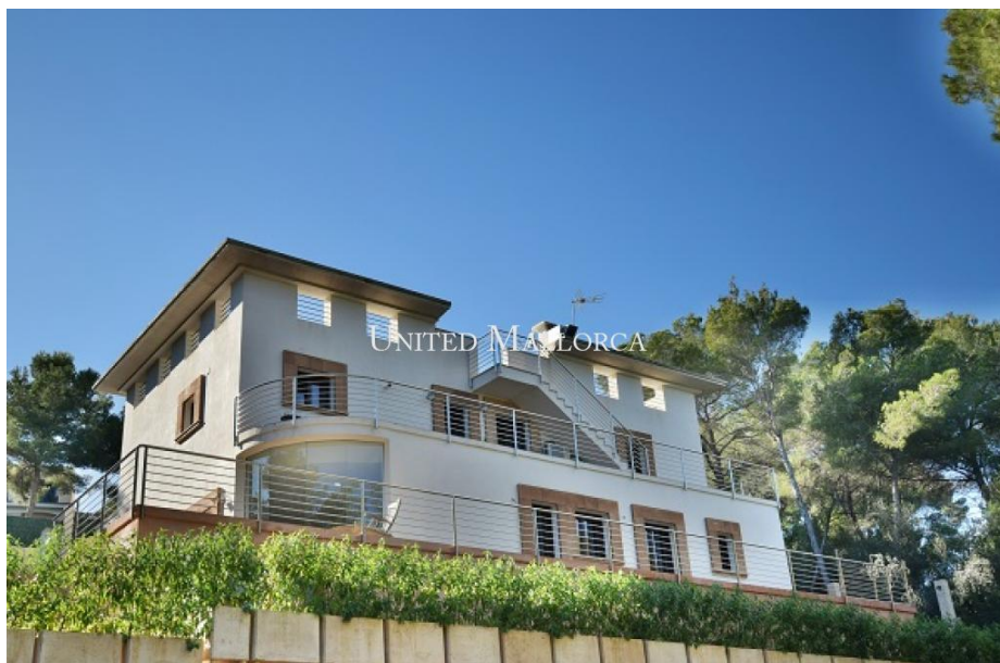
VILLA IN CALA VINYAS WITH PRIVACY AND CLOSE TO THE BEACH