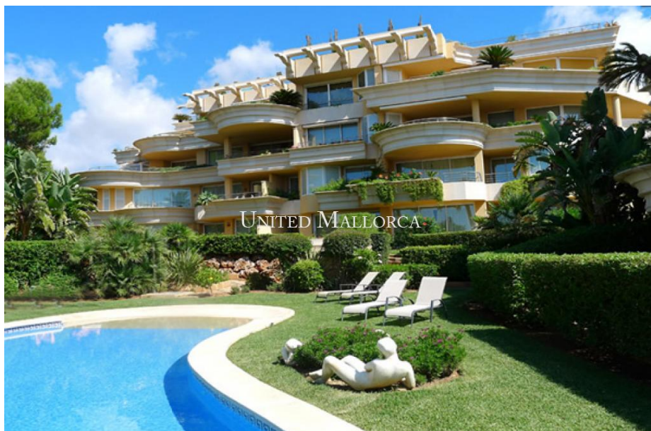
LUXURY APARTMENT IN SECOND SEA LINE IN NOVA SANTA PONSÀ